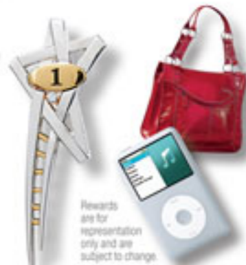
Rewards are for representation only and are subject to change.

*Sales tax is required on the suggested retail value of the Section 1 products in the bonus. Suggested retail values can be found through the LearnMK™ section of the Mary Kay InTouch™ Web site.