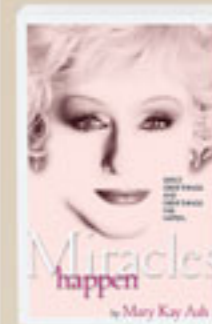
One Mary Kay Autobiography

Products shown are a visual representation of an approximate product mix, volume and quantity. The Company periodically updates product packaging. Therefore, the product you receive may be packaged differently than shown in this brochure.