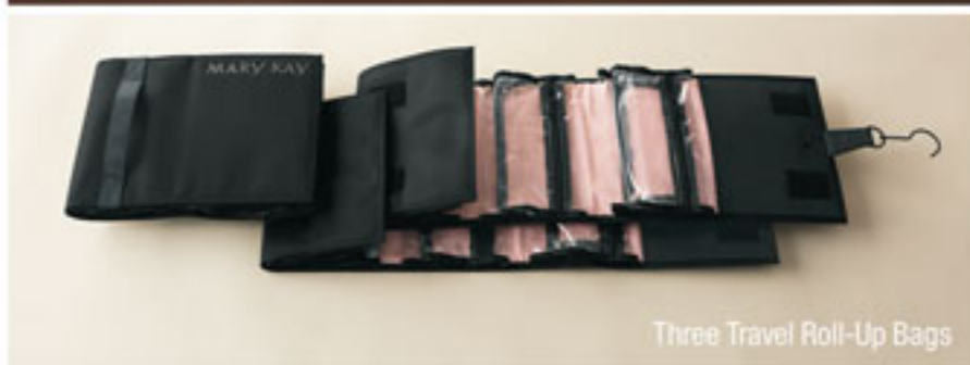
Three Travel Roll-Up Bags