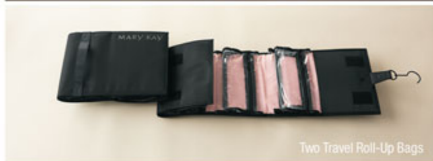
Two Travel Roll-Up Bags