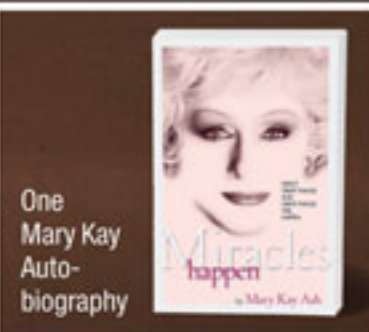
One Mary Kay Auto-biography