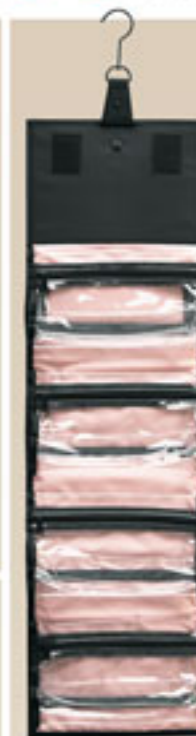
One Travel Roll-Up Bag

When you order this amount: $600 wholesale