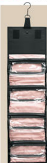
One Travel Roll-Up Bag