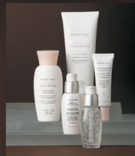
One Miracle Set

*Sales tax is required on the suggested retail value of the Section 1 products in the bonus. Suggested retail values can be found in the latest issue of Applause® magazine and through the LearnMK® section of the Mary Kay InTouch® Web site.