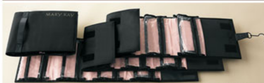
Four Travel Roll-Up Bags