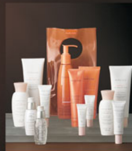
One Miracle Set One TimeWise® Basic Set One Satin Set

*Sales tax is required on the suggested retail value of the Section 1 products in the bonus. Suggested retail values can be found in the latest issue of Applause® magazine and through the LearnMK® section of the Mary Kay InTouch® Web site.