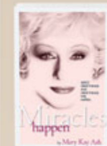
One Mary Kay Autobiography

Products shown are a visual representation of an approximate product mix, volume and quantity. The Company periodically updates product packaging. Therefore, the product you receive may be packaged differently than shown in this brochure.