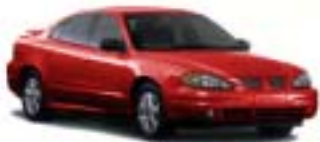
Red Grand Am