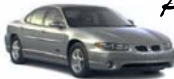
Platinum Grand Prix