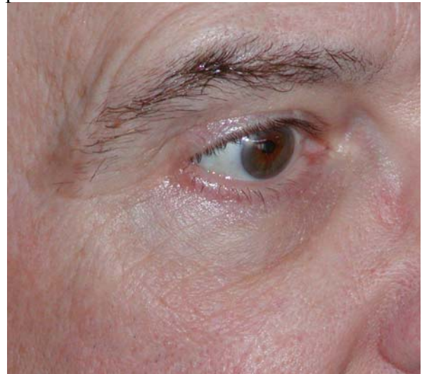
Firming Eye Cream (5 months) and Line Reducer (3 wks)