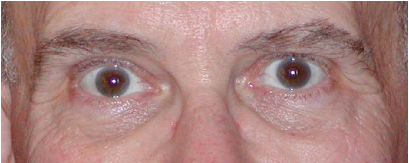
October, 2006—No eye products at all. Before picture.